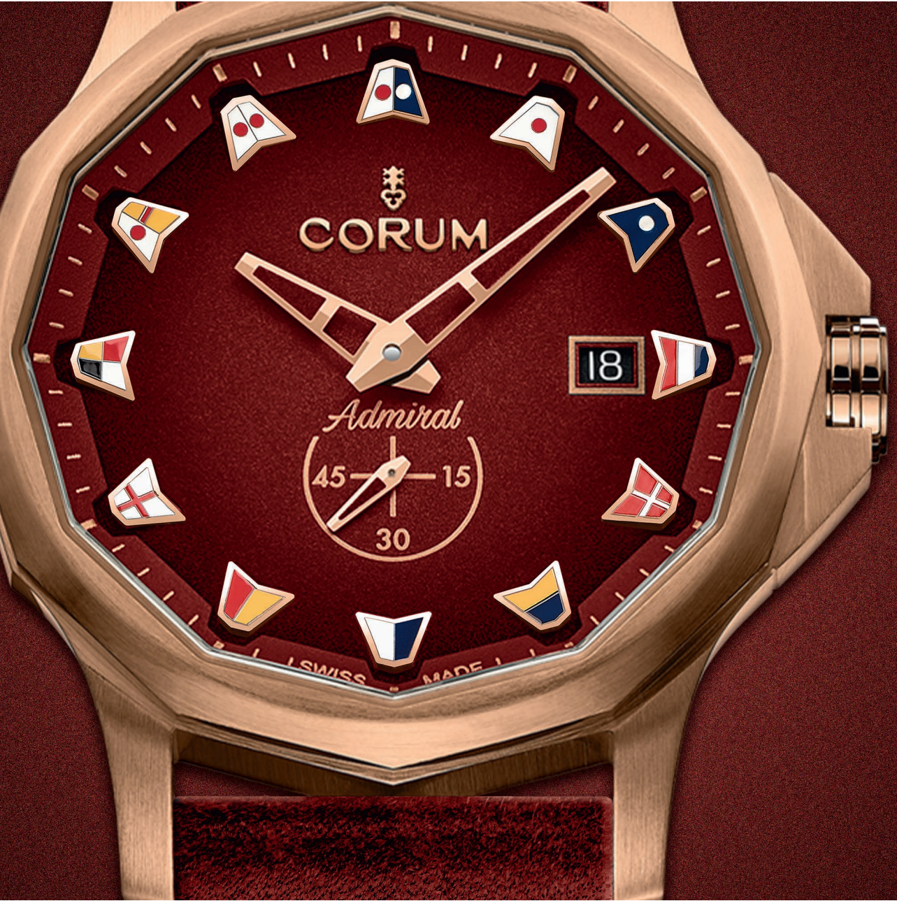
A395/04319 Limited edition of 100