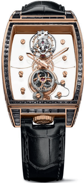
BI00/03983 Unique piece