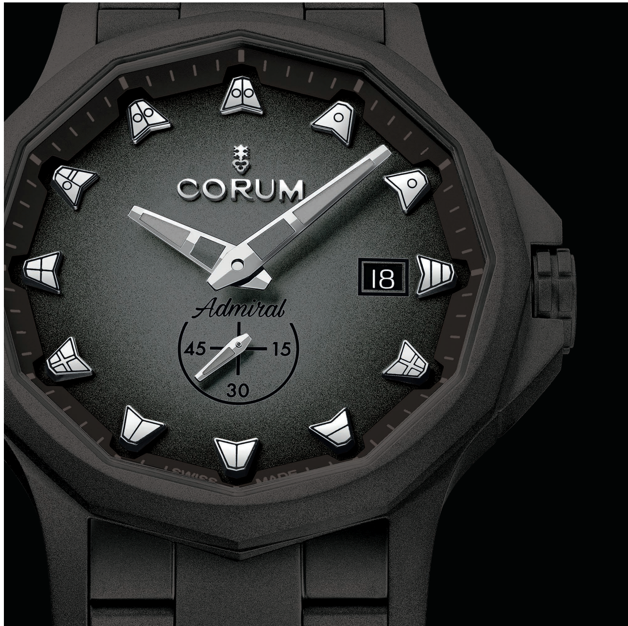
A395/04324 Limited edition of 100