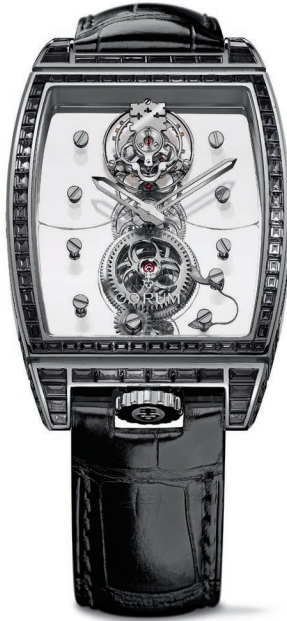
BI00/03985 Unique piece