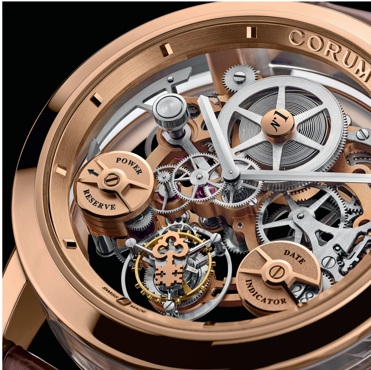
Z300/03999 Unique piece