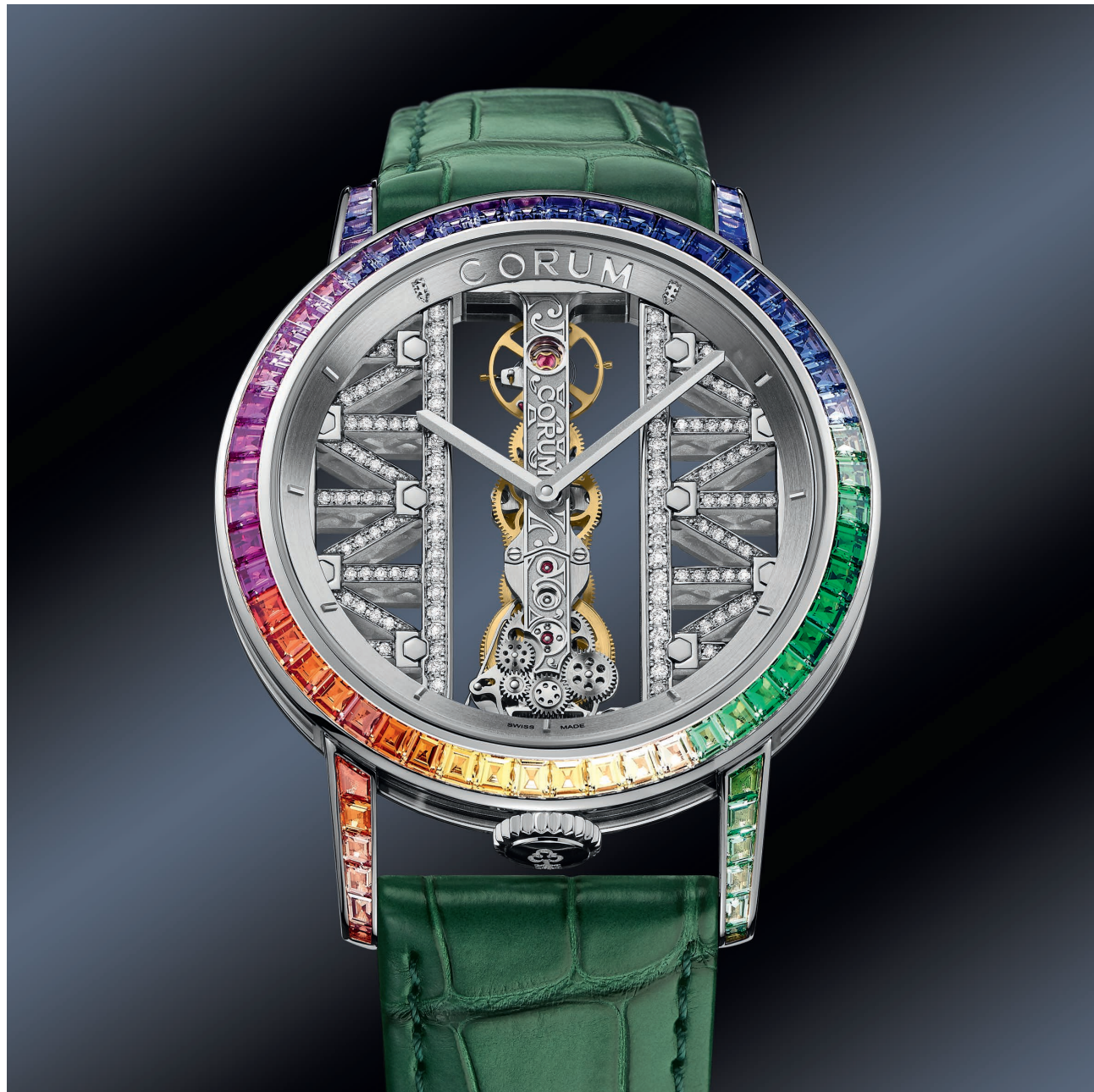
B113/03334 Limited edition of 18