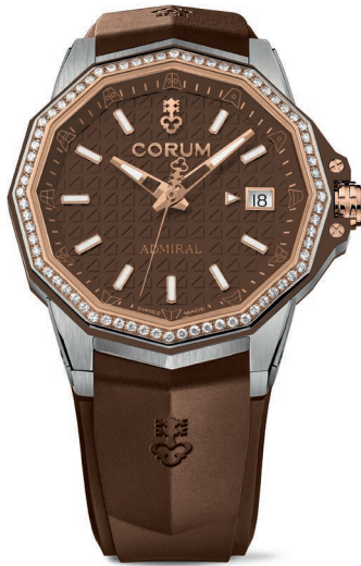
A082/04263 Limited edition of 150