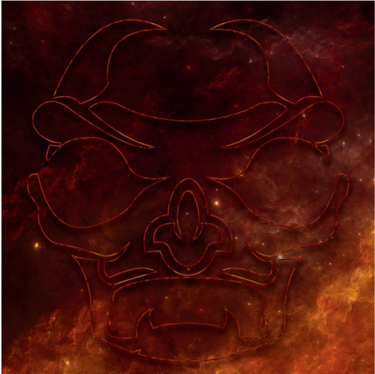
L771/04160 Limited edition of 88