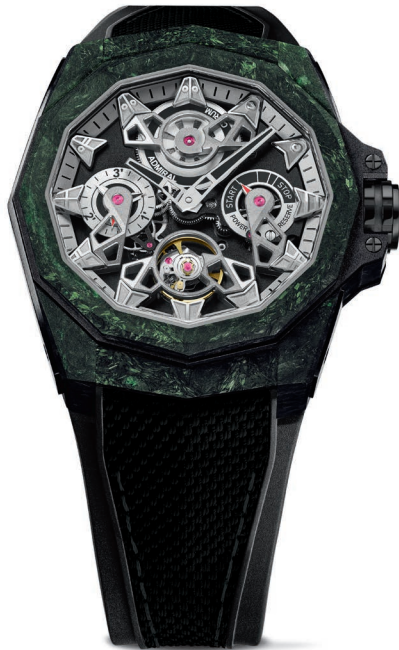
A297/04290 Limited edition of 25