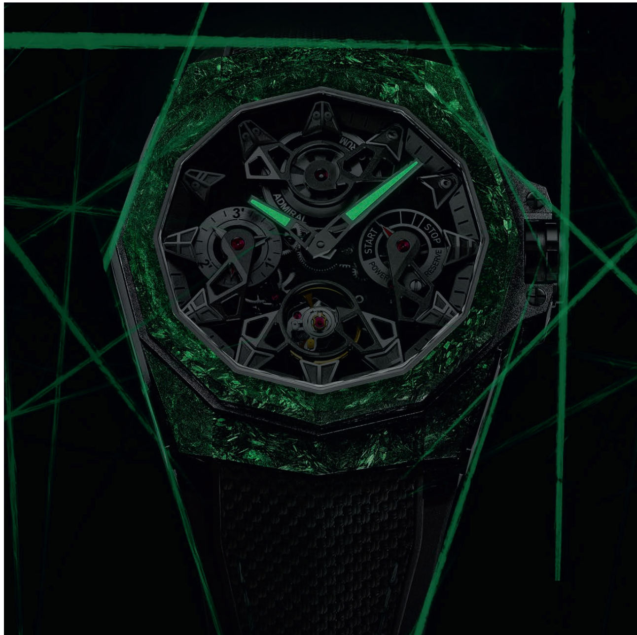
A298/04277 Limited edition of 48