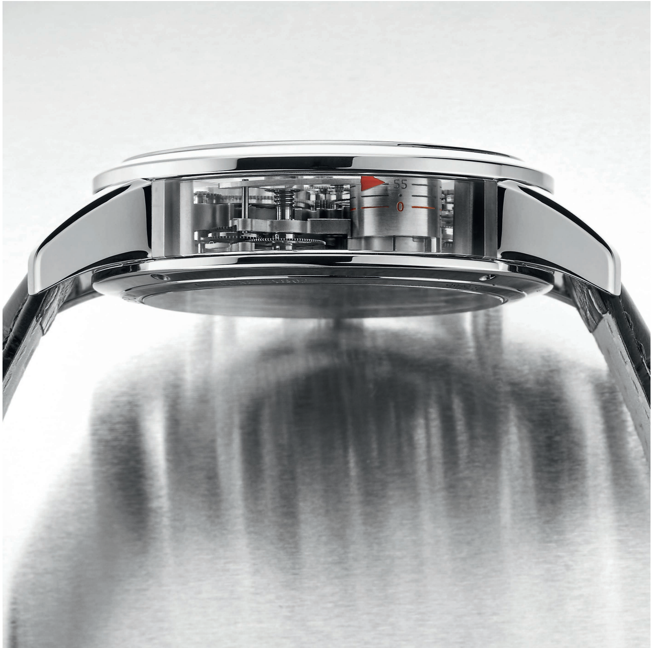
Z300/04076 Unique piece