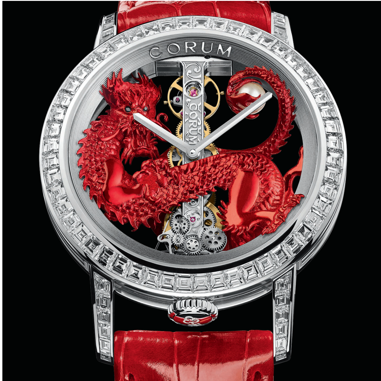
BII3/04359 Unique piece

Custom-made models available upon request