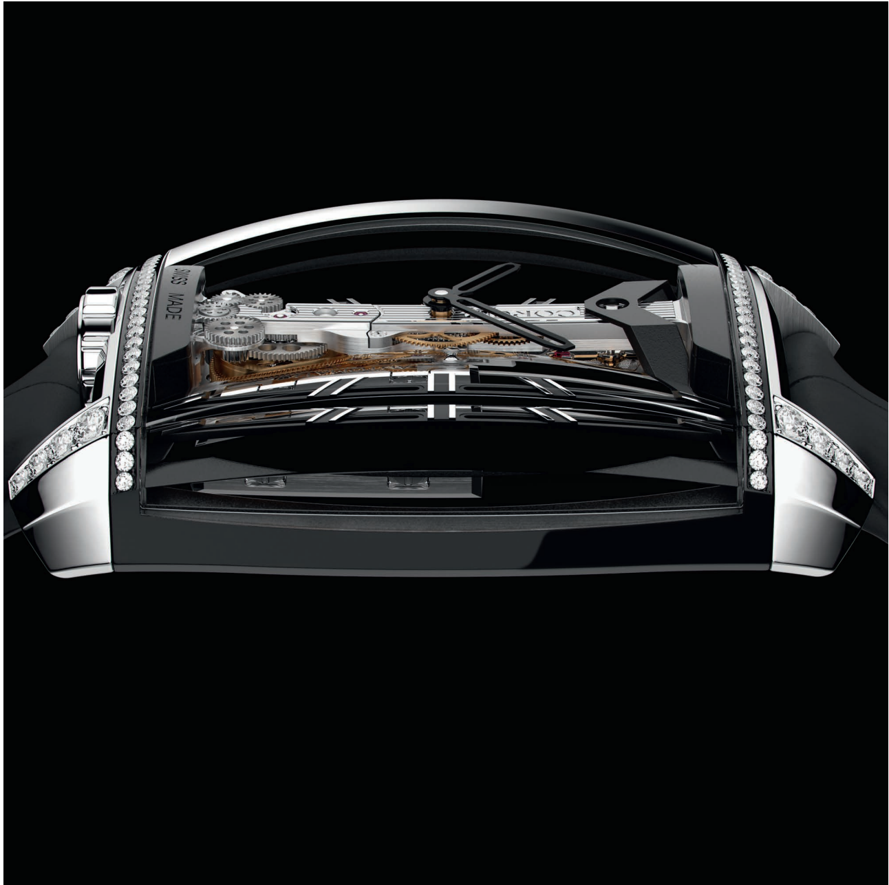
B313/04281 Limited edition of 25