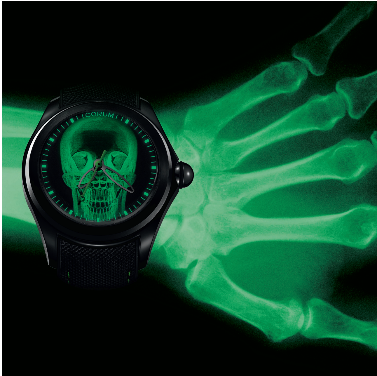
L082/04330 Limited edition of 666