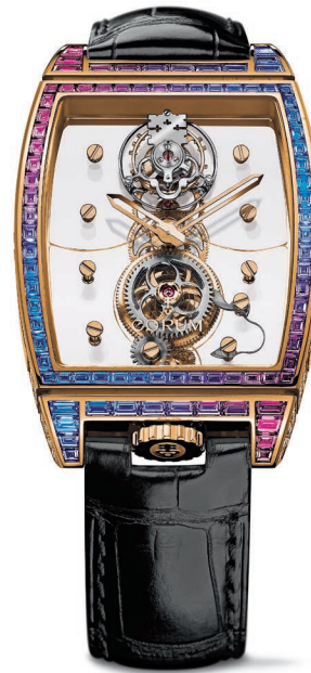
BI00/03982 Unique piece